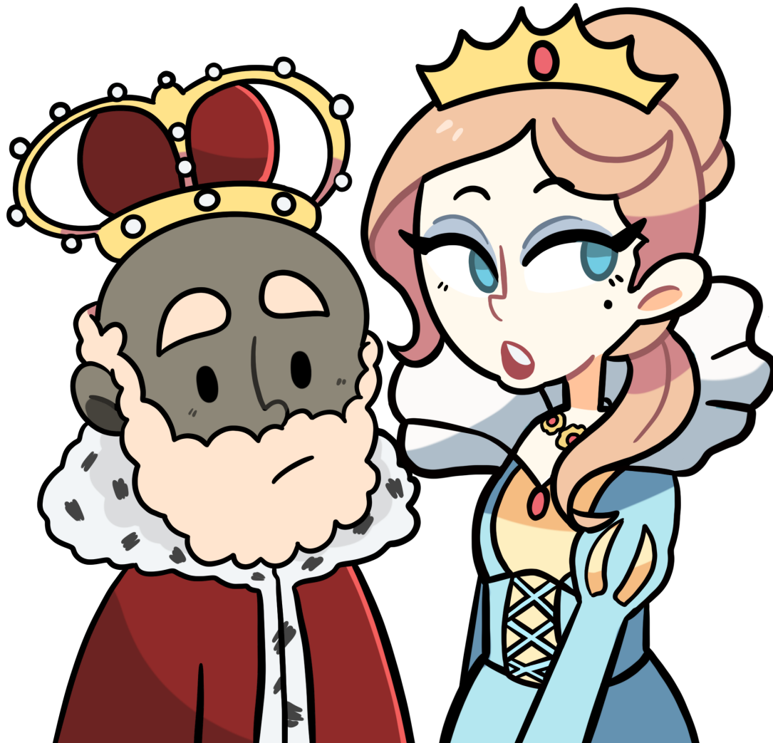
the king and queen